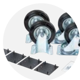
Castor Kit CASS1

Disclaimer: all dimensions and weights are approximate