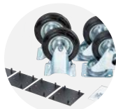
Castor Kit CASS1