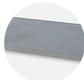
TBC/FBC 2' shelf SHE-CH2